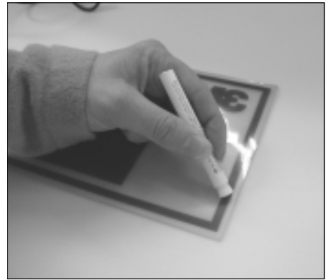
Plate Edge Sealing

Edge sealing may also be used to prevent inks and other solvents from migrating between the tape and plate causing plate lifting during the press operation.